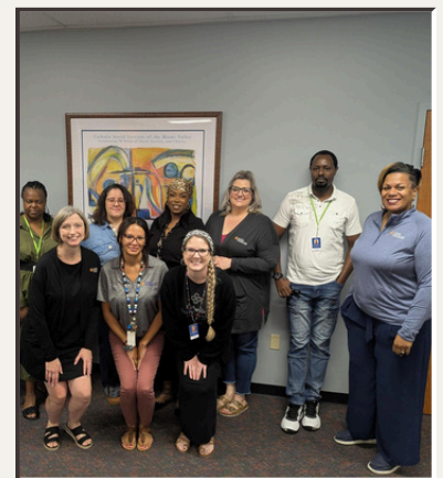
Center for Families