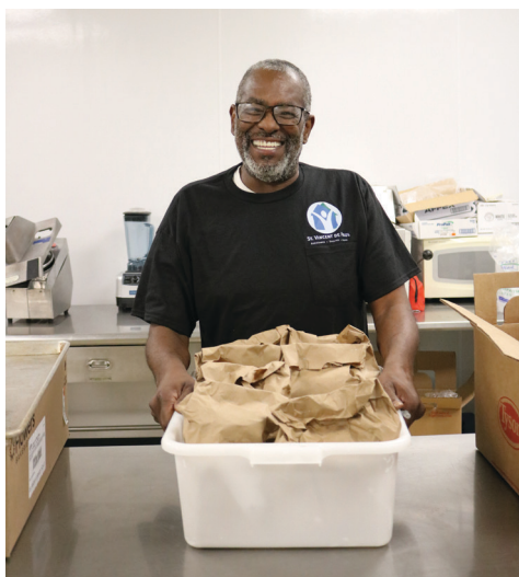
Donations of casseroles and bag lunches help provide meals for more than 200 men, women, and children who stay at the St. Vincent de Paul shelter each night.